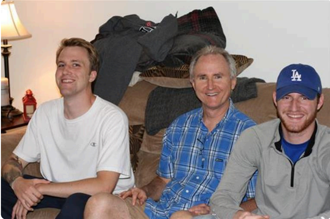
Wonderful husband and father.